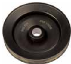
300-701 E Series Van, Ford Full Size Trucks 1992-83 (to 3/92)