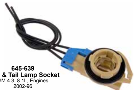
645-639 Stop & Tail Lamp Socket