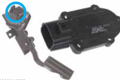
699-206 Crown Victoria, Grand Marquis, Town Car 2008-06

Monitors and communicates the position of the Pedal to the PCM