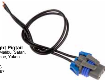
645-628 Low Beam Headlight Pigtail Astro, Cavalier, Express, Malibu, Safari, Savana, Silverado, Tahoe, Yukon 2008-95

Pigtails are used to complete the repair by cutting the failed plug and connecting the new Pigtail. Sockets are used with light bulbs and have the same repair procedure